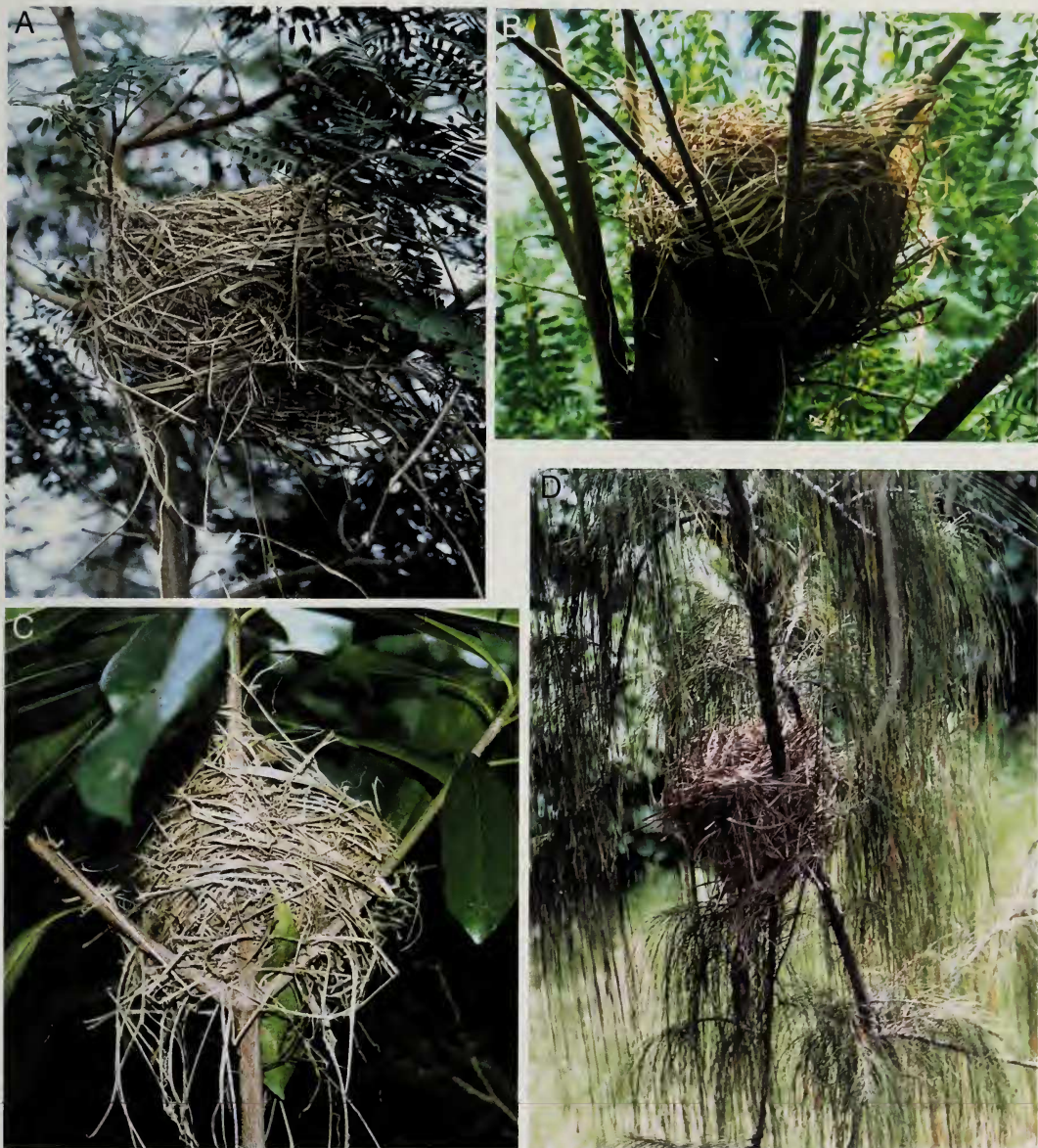
FIG. 2. Placement and structure of Nightingale Reed-Warbler ( Acrocephalus luscini ) nests, Saipan, February 1997 to July 1998. (A) Typical nest placement within introduced Leucaena leucocephala . (B) Typhoon-damaged Leucaena leucocephala trunk with lateral placement of the nest. (C) Nest placement in fork of native Ochrosia mariannensis . (D) Nest attached to drooping branch of indigenous Casuarina equisetifolia .

the nest (Fig. 2a). Some nests located in tangantangan were constructed on the top of typhoon-damaged trunks supported by regrowth branchlets (Fig. 2b). Nests found in native lipstick trees were supported by the main trunk and 3–5 branches that forked from the center of the tree (Fig. 2c). Four of six nests in iron-